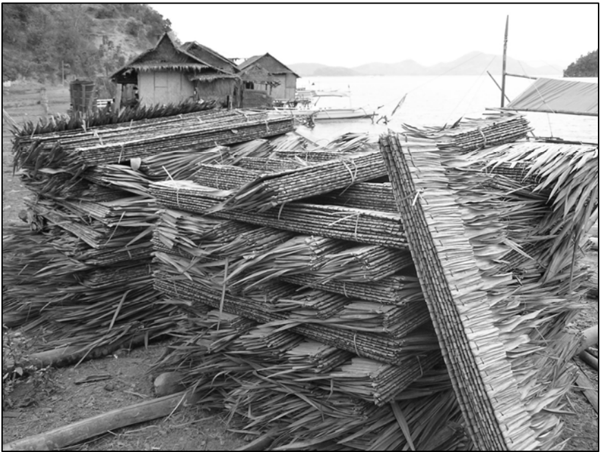
Figure 1. Nipa shingles ready for sale, San Jose, Philippines.

Despite its economic and cultural importance, two situations threaten the nipa shingle industry. One issue is environmental and the other relates to gender and socioeconomics. In terms of ecological pressure, despite mangrove's economic and social importance, deforestation threatens nipa. The Philippines has one of the highest rates of deforestation in the world, including mangrove forests (Laarman et al. 1995). In the 1920s there were at least 450,000 hectares of mangroves throughout the Philippines (Courtney and White 2000). However, by 1998 mangrove coverage had decreased to less than 123,000 hectares (Green and Alexander 2002), and the numbers continue to decline (Macintosh 1996). One of the main reasons for the decline is aquaculture pond construction. Fishing is an important industry in the Philippines and in an effort to increase the food supply and export earnings, Filipinos are constructing controlled pond systems in which to raise fish. Most often these ponds are on the natural coastline, where mangroves