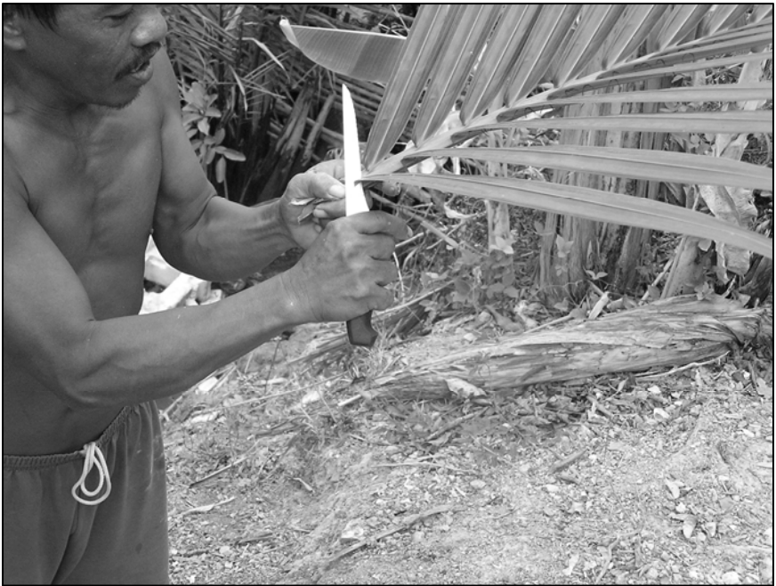
Figure 4. Male harvester removing leaflets from nipa frond.

Nipa ( N. fruticans ) as mentioned, is the one member of the palm family (Arecaceae) that is considered a mangrove (Tomlinson 1986). A mangrove is a woody tree or shrub that grows in coastal habitats, and occurs in shallow water and intertidal zones in tropical and subtropical regions. Following the criteria of Tomlinson (1986) 14 families, 16