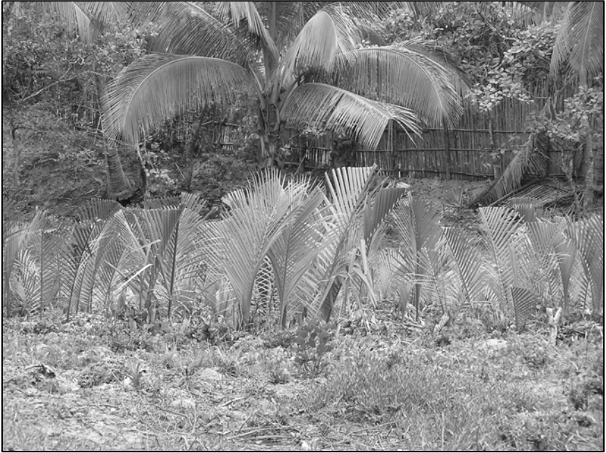
Figure 8. Nipa palm plantation. The short palms with only the leaves growing above the surface in the foreground of the photo are the nipa palms.