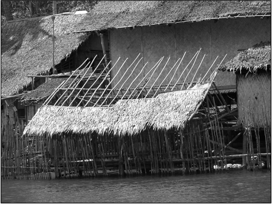
Figure 2. Nipa hut in San Jose, Philippines roofed with nipa shingles.