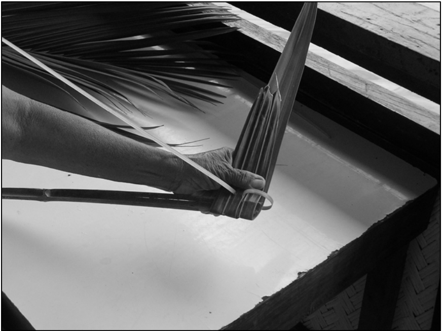
Figure 5. Sewing nipa leaflet over bamboo.

In terms of nipa shingle production, men harvest the palm material. They remove the oldest fronds, cutting the base a few inches above the water. Harvesters make a point to leave at least two new fronds, so that the plant continues to grow and photosynthesize. The men then cut the leaflets from the frond (Figure 4). Although men do the majority of the harvesting, women will sometimes cut off the leaflets.