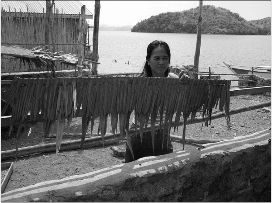
Figure 6. Nipa shingle drying.