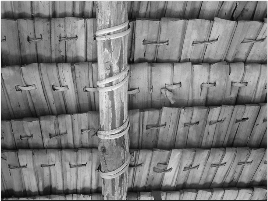
Figure 7. Underside of nipa roof, showing shingles lashed to beam.